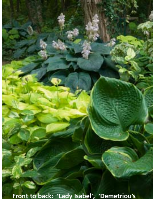
Gold', and 'Blue Angel' hostas.